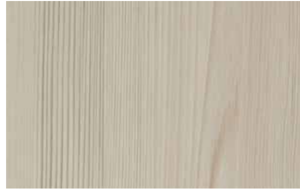
CPL WHITE PINE