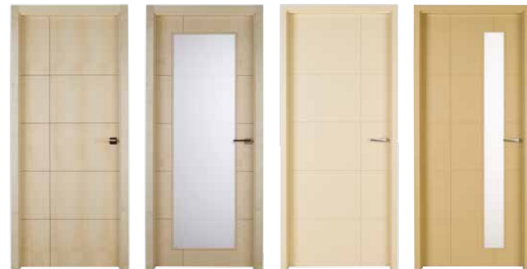
DOORS model 11 vener maple AM DOORFRAME Mini Obtus vener maple AM