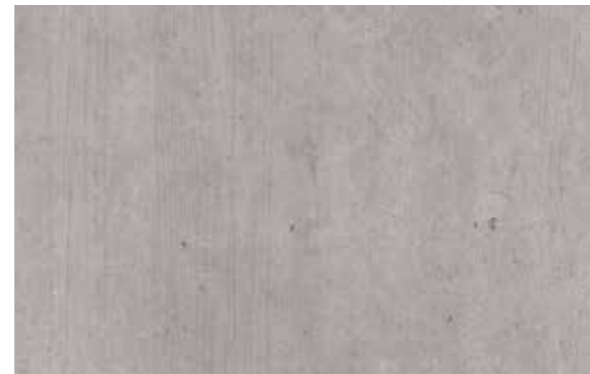
SAPDECOR CONCRETE TIMBER