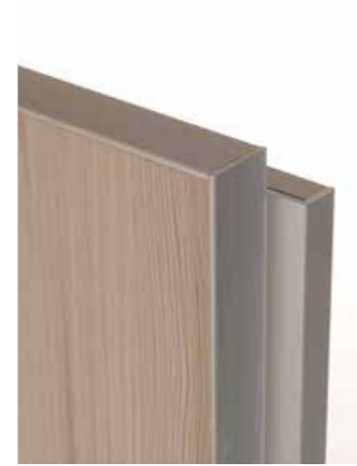
ALUMINIUM EDGE FOR REVERSE OPENING