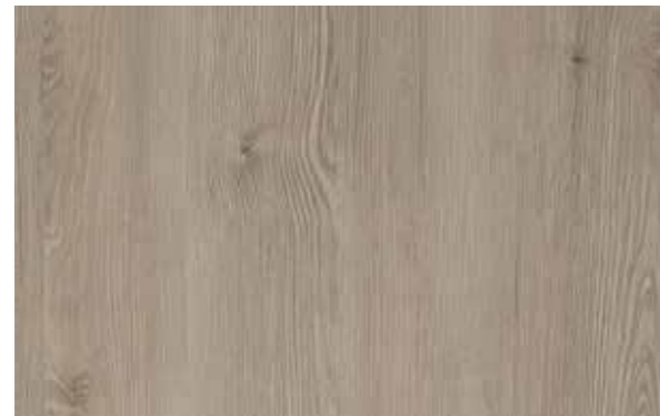
CPL GREY PINE