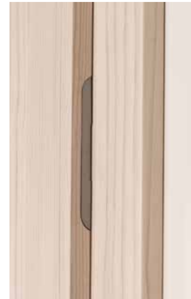
CONCEALED HINGE FOR SEMI-RAISE-SELF-CLOSING DOORS