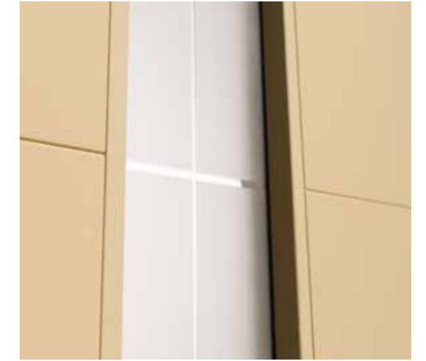
SUNKEN MOULDINGS FOR ARTIFICIAL SURFACES