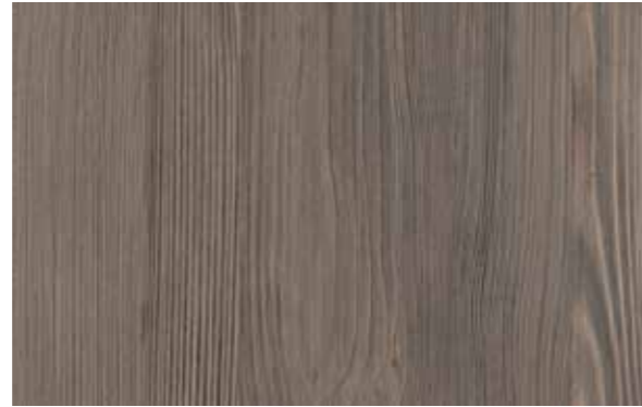
CPL SMOKED PINE