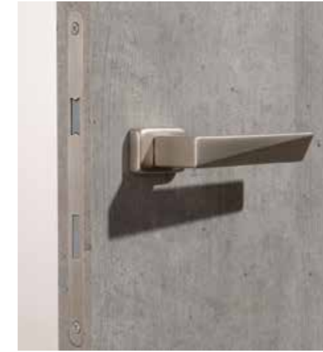
NEW MAGNETIC LOCK