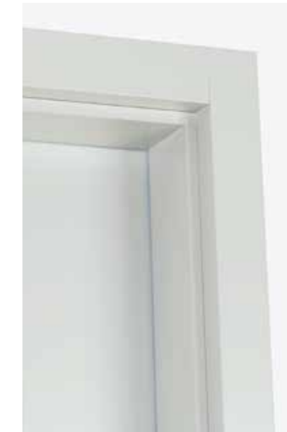
TOP ABS EDGES