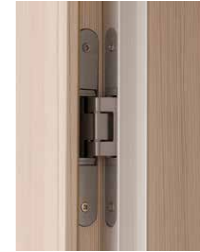
HINGE FOR REVERSING DOORS